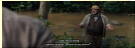
Picture 2. Bethany realizing that she is in a man's body

The central critique of this film is delivered through the transformation of Bethany into the game and forced into the body of Professor Shelly Oberon, an "overweight, middle-aged man". This scene shows a direct shocking break between who she feels she is on the inside and what her body looks like on the outside. Her horrified reaction, captured in her line, " I look like a living garden gnome. Where is my phone? " is deeply meaningful. The "garden gnome" comment shows her identity is still tied to appearance, but her desperate need for her phone reveals that her sense of self was built on the performance of femininity through social media. When Bethany loses her feminine body, the first thing she thought of doing is look for her phone that she used to perform femininity through her social media. This illustrated Butler's argument that " There is no gender identity behind the