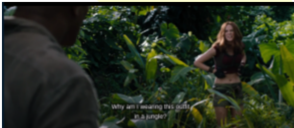
Picture 4. Ruby Roundhouse's outfit

Gender is always considered from its biological appearances. But the gender is not that simple. The traditional gender norms stated that gender is what is dictated by the anatomical body, asserting a fixed relationship between biological sex and social performance. Judith Butler's concept of performativity, that gender is not a core substance, but a constant of doing repeated. The film Jumanji: Welcome to the Jungle provides a literary theoretical framework, where the game mechanism forces them to act as a new character that is entirely disconnected from their internal self. These things are shown by both of the female characters, Bethany and Martha. They have a hard