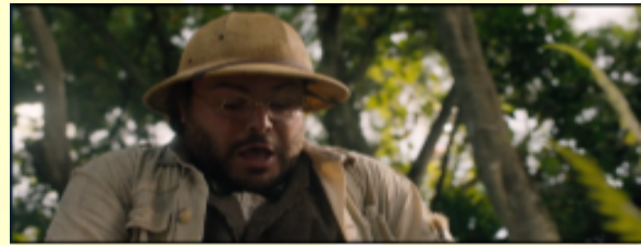
Picture 6. Bethany's reaction on discovering new thing

Spencer and Fridge also face the same problem as Bethany and Martha, even though they still turn into male avatars. But, they went through different personalities. Spencer is a calm kid that does not often have courage in facing his daily life. But in the game, he was forced to be strong, supported by his body character. His attempt to repair the helicopter during flight represents Spencer's brave act