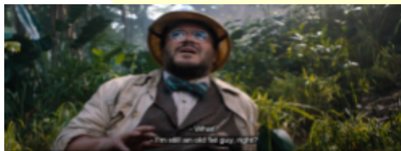
Picture 3. Bethany making sure of her appearance

expressions of gender; that identity is performatively constituted by the very 'expressions' that are said to be its results. " (Butler, 1990, p. 25). The film removes the physical "expression" but leaves her personality and the way she thinks. The cinematography in this scene uses medium shots, using the other character's shoulder while showing the panic in Bethany's action and expression. This