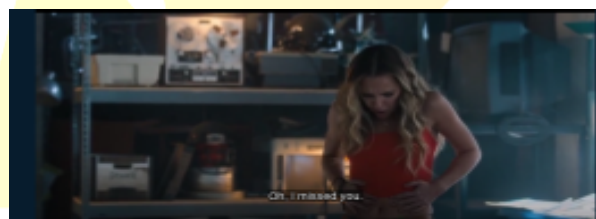
Picture 10. Bethany reunites with her real body.

Even her clumsy errors, humorous difficulties, and hesitations help her to emphasize that the process of personal development is slow and legitimate, and it cannot happen immediately and without flaws. Her adaptation to her new male body and her struggle to survive in the world of the game, which is both physical and social, underscores that identities are constructed by choice and experience and not by following social norms of what it means to be a woman. The character of Bethany reveals that selfhood is dynamically constructed rather than static, emerging from purposeful action, moral responsibility, and compassionate engagement with others. The experience of her journey brings to light that gendered behavior is not an imprinted characteristic but learned and practiced and that the way out is to go against these scripts so that she can rebrand herself through her daring, selflessness, and being able to prioritize values over appearance or recognition by other