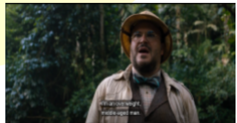
Picture 8. Bethany reacts to her new appearance.

The moment when the gender performance of Bethany fails is when she enters the game. Her first reaction to finding herself in the body of Professor Shelly Oberon, an older male avatar, makes her panic, which demonstrates the extent to which her identity was tied to appearance and performance of femininity. She cannot accept the body that does not match the one that she was keeping up her image of. This scene is a visual