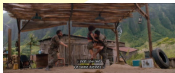
Picture 5. Dance fighting scene

The most crucial part of Martha's different act is on the dance fighting. Her strengthness helps her survive in the Jumanji world, but it makes her struggle to adapt to her new version. The dance is not an expression of Martha's personality, but a repetition of stylized femininity by the game rules. Through the training by Bethany, Martha is forced to tease the guard with her feminine appearance. After a lot of repetition, Martha ultimately mastered her avatar, which shows the continuous performance of gendered roles will create a new sense of self, with the help of her outfit and gender as a woman. But, since it was not her real identity to flirt with people, she attempted an awkward moment in front of the guard. Then a radio nearby her on, triggering her ability, the dance fighting. She then actively shows her skill, using the combination of martial arts and dance to unconscious the guard. This scene shows the shy Martha