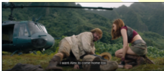
Picture 9. The group helps Alex

In the game, the liberation of Bethany is reflected in her decisions and behaviors, the departure of the femininity being enacted by her to do something that conforms to the value of her faith and conscience. She ceases to pay attention to beauty, social status, and internet popularity and starts to behave basing herself on empathy, bravery, and knowledge of other people. One such