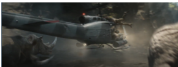
Picture 7. Spencer's act on repairing helicopter

Spencer and Fridge also face the same problem as Bethany and Martha, even though they still turn into male avatars. But, they went through different personalities. Spencer is a calm kid that does not often have courage in facing his daily life. But in the game, he was forced to be strong, supported by his body character. His attempt to repair the helicopter during flight represents Spencer's brave act